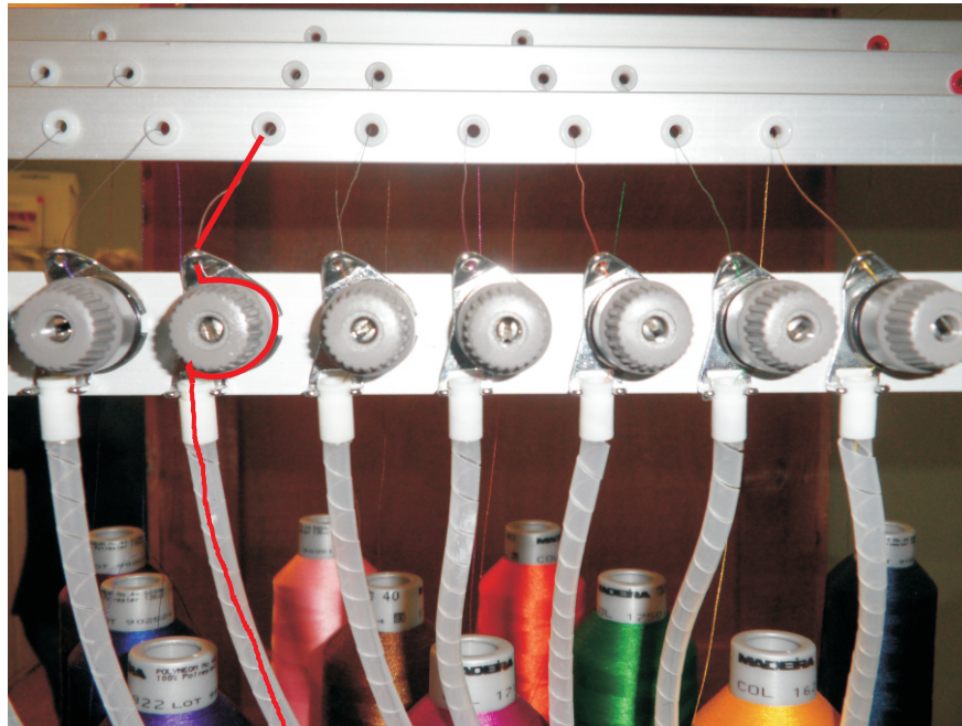
STEP 1 Make sure thread goes between the plates